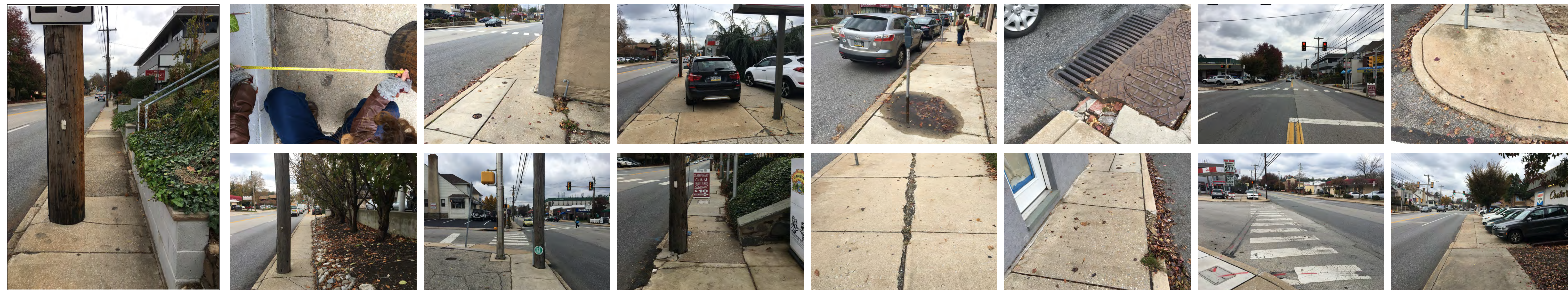
Narrow sidewalks, low curbs adjacent to roadway, buildings and vehicular parking that protrude into the right of way, and utility infrastructure located in the right of way create an unwelcoming and unsafe pedestrian experience.